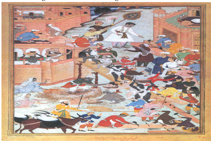
Figure 7.4: Women working in the construction of Agra Fort. Geeti Sen. Paintings from AkbarNama.