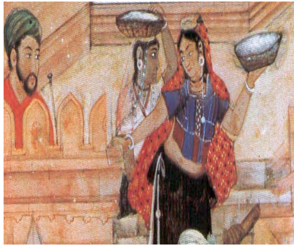
Figure 7.3: Women holding construction material.