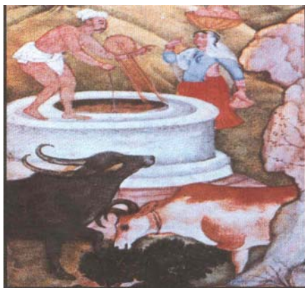
Figure 7.1: A woman bring food for her husband in the field. (Anwar-i-Suhaili 1597)

Women also had done some odd jobs with their men folk. After harvest they collect wastage from the fields for the purpose of fodder for their animals. Rice beating and husking of grains were exclusively women's job. They had equally shared in fed sugarcane and oil feeds into the ox-driven presses through worked by the men. Their daily job was to cook food and carry it to their men working in the fields (Moosvi,1994;116).