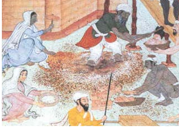
Figure 7.2: Women rubbed the stones for constructions.