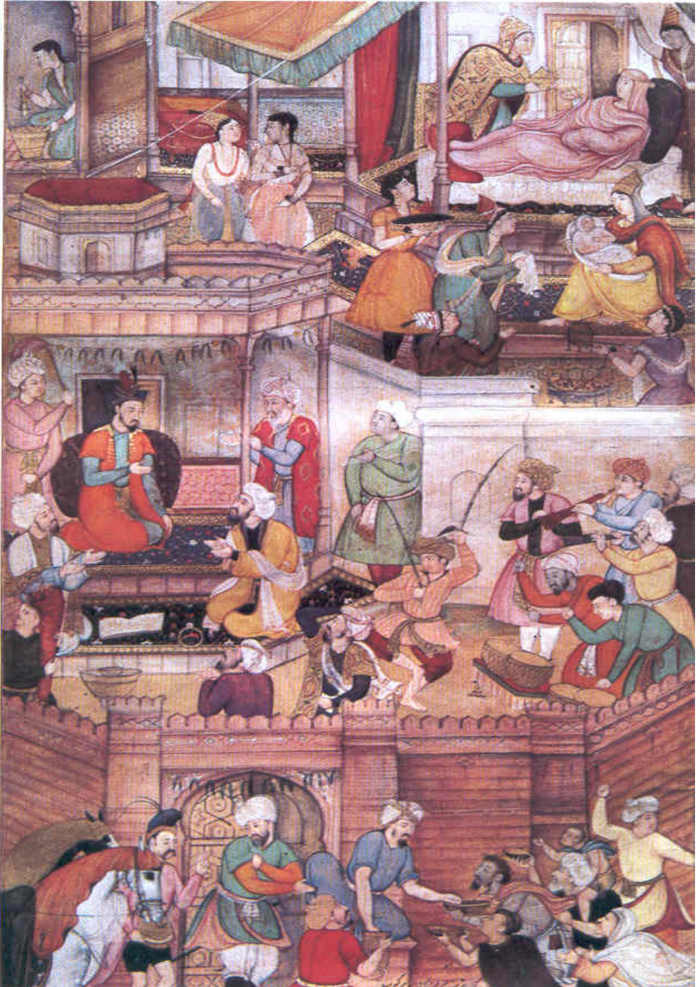
Figure 7.6: Women work as mid-wives Geeti, Sen, Paintings from Akbar Nama.